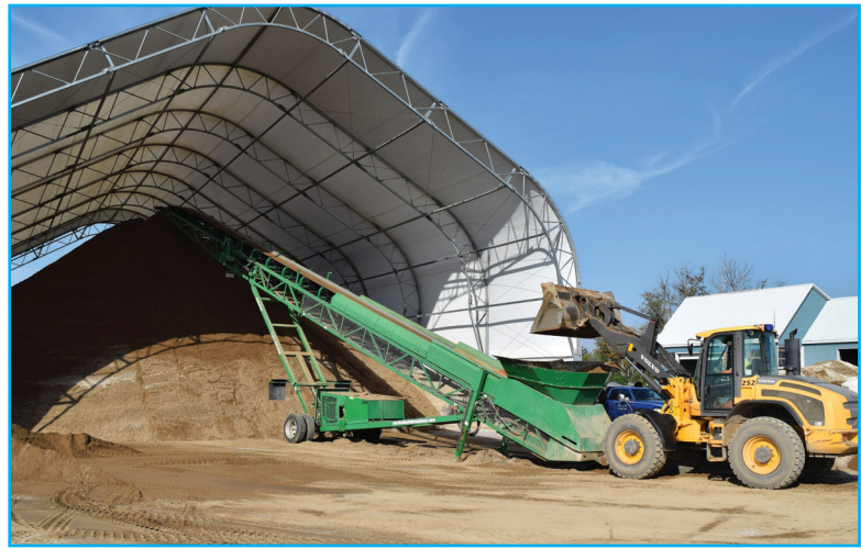
Public Works staff loading sand into the winter storage tent

The safe and efficient movement of vehicles and pedestrians is the key objective of a winter road maintenance plan. By