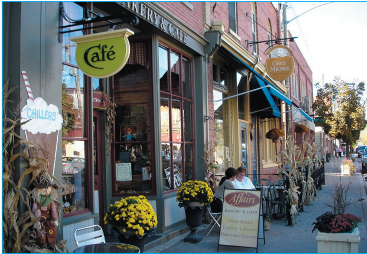
A great example of an attractive streetscape from downtown Creemore.

It's known that people will travel for an authentic downtown experience and atmosphere which includes a variety of shopping, dining, and cultural activities. Therefore, it's important that the quality of the façade is reflective of the experience that a potential customer will have. In addition, façade improvements will also encourage local and outside investment into our communities by filling vacant buildings. Everyone benefits from a strong and resilient business community that provides increased employment opportunities and services to the community.