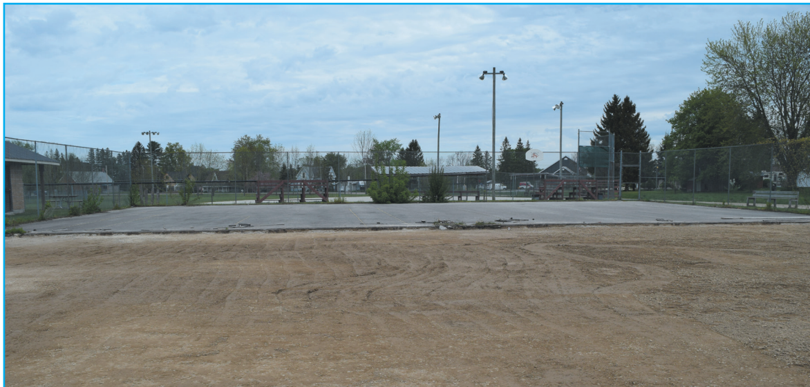
Construction is currently underway at the New Lowell Recreation Park tennis courts.