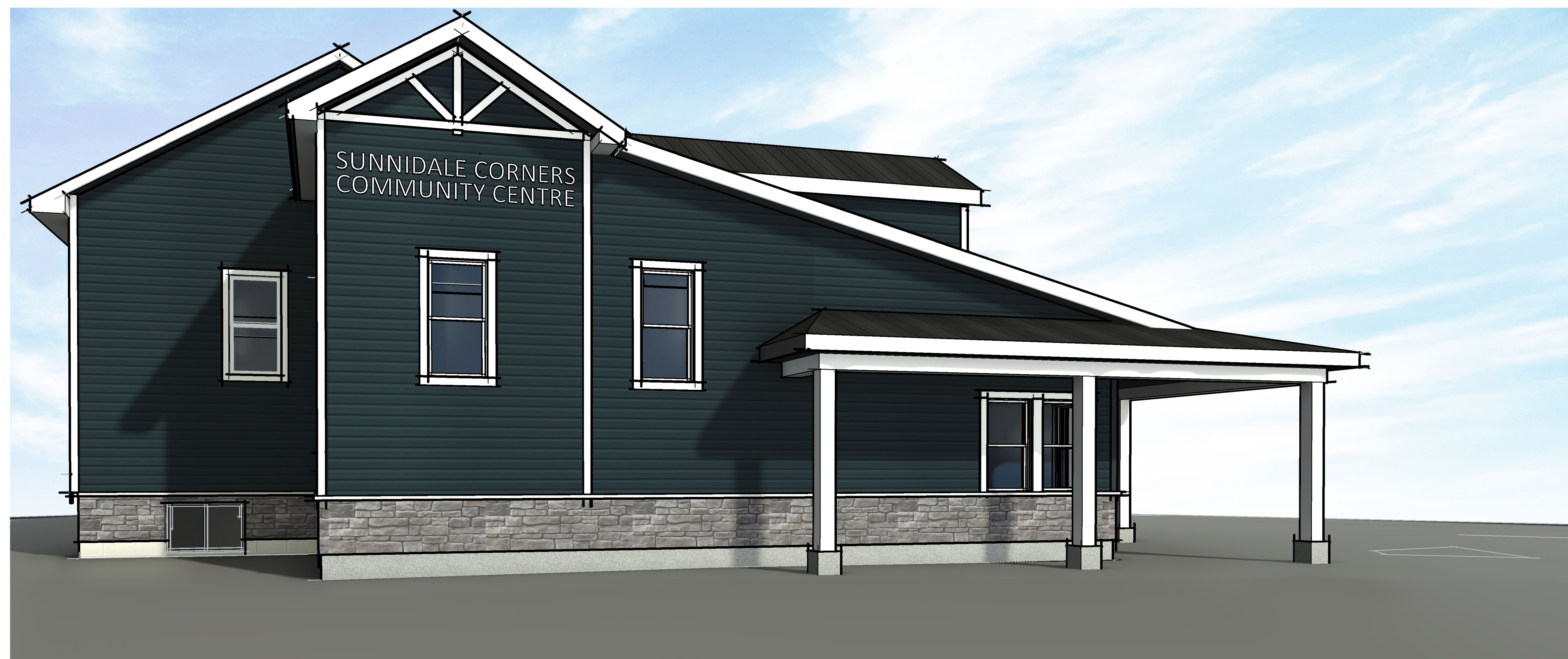
Exterior Perspective 2