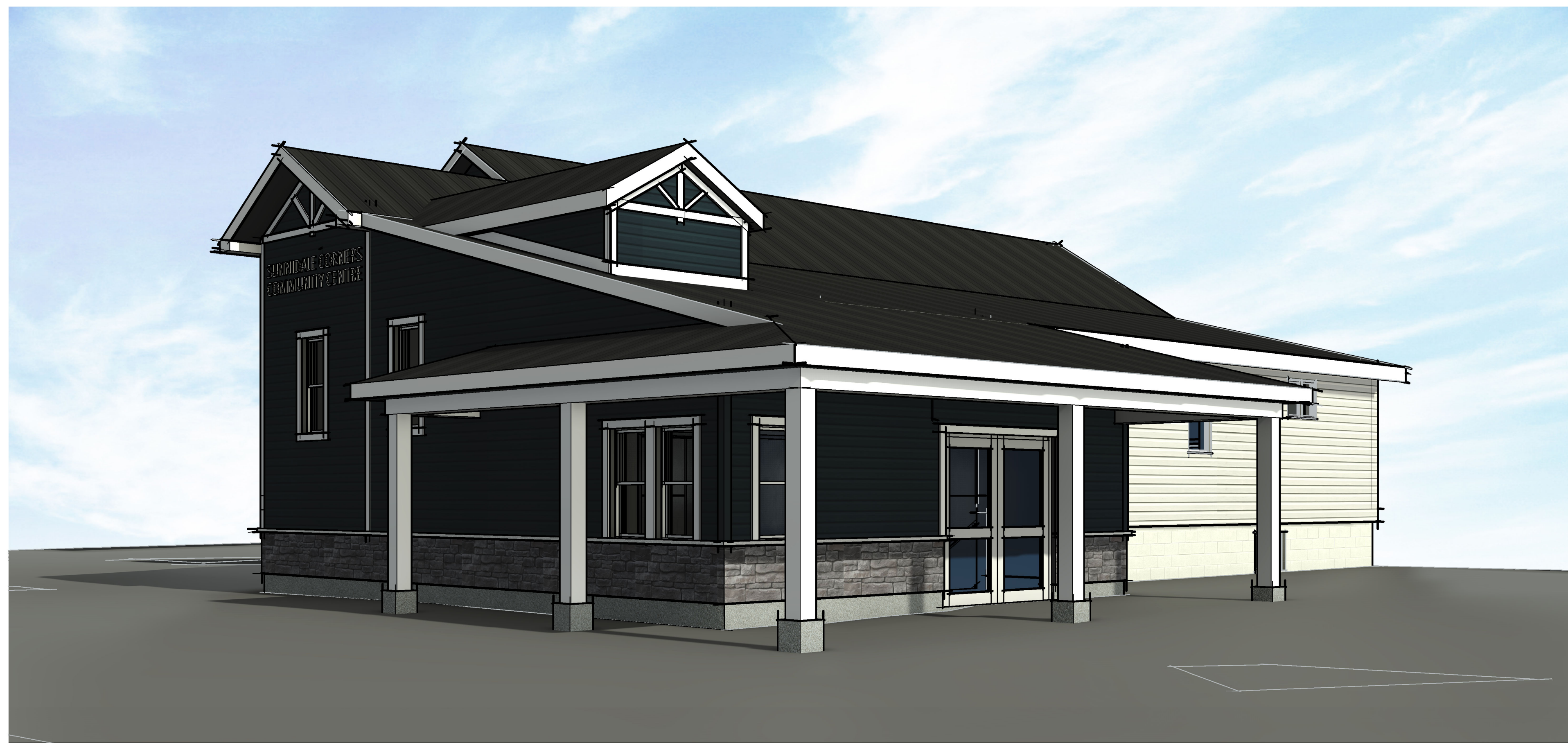
Exterior Perspective 1